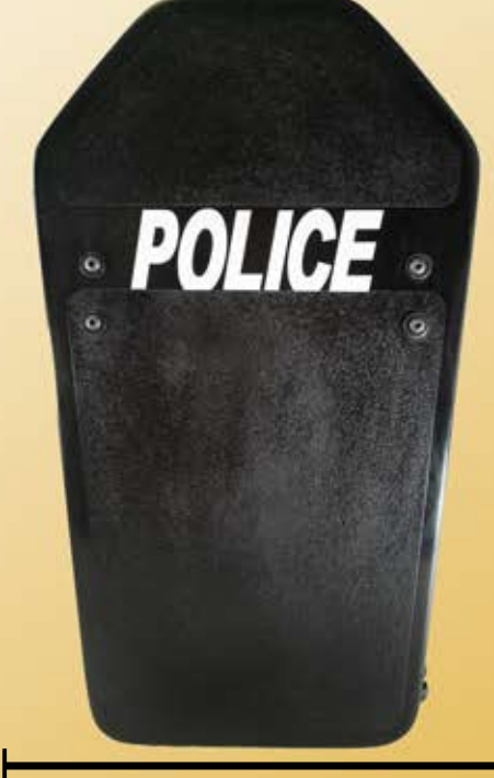
Ballistic coverage area of 16" x 28"

AAM shields are made from high quality composites, which properties include: